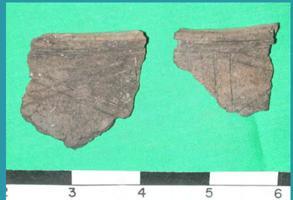
Surfside Incised Pottery (Florida Museum of Natural History)

This type of pottery is associated with the Glades IIIa cultural period, which spans from 1200 CE to 1400 CE (FLMNH). It is characterized by one or more incised lines under the rim of the vessel, and it is found throughout south Florida (Peach State Archaeological Society). As the sherds from our collection were found on the Big Cypress Reservation, it is quite possible that they are Surfside Incised.